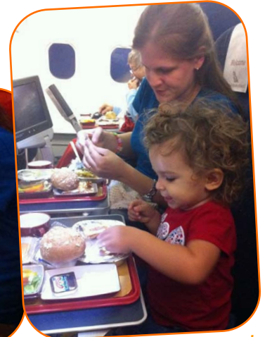
Yum! We always look forward to the food on South African airways flights

Since we left shortly after the coup in April we didn't really know what to expect politically when we arrived. For the most part things have seemed pretty calm; however, last week there was an attack on the military base where most of the weapons are stored (a few miles from our house), but, after two hours, the soldiers were able to fight off the attackers. We're praying for God to work in the hearts of the leaders of this nation and bring lasting peace.