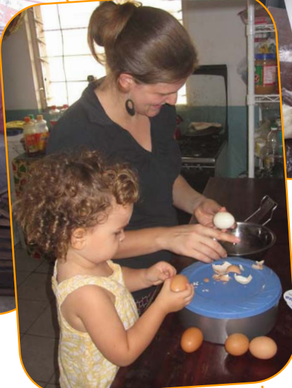
Peeling eggs with Mama to make egg salad for dinner

When I look back over the last two years of her life I marvel at how flexible she is, how healthy she's been, and what a blessing God gave to our family. I can never say it enough – thank you for all of your prayers for our precious little girl!