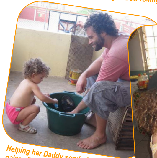
Helping her Daddy scrub the paint off of his shoes