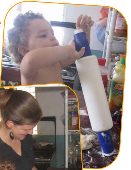
Halfway through cooking my Naan I felt I was missing quite a bit of dough. That's when I discovered that my little helper had shoved several handfuls into my hollow rolling pin

We potty trained her a few weeks ago and she loves to proudly show off her princess undies 😊 She's officially a big kid now 😊