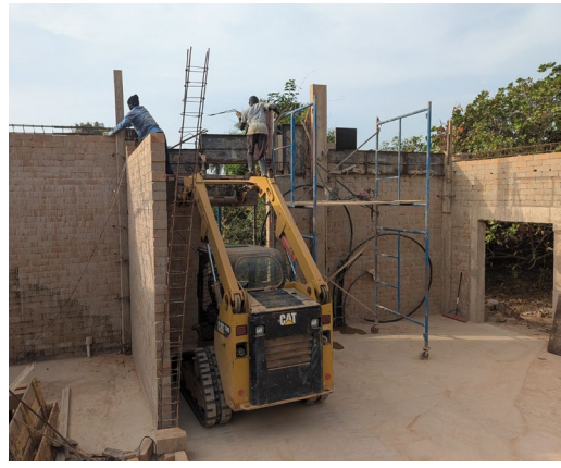
Blocks, columns, and bond beams continue to go up. The shop is advancing!

though some sections of it aren't up to full height yet, they're all above 10', which is enough to get a feel for what the inside will be like! Internal dividing walls are also going up as we continue to work toward the goal of finishing one quarter of the shop, the north lean-to which will house the machine shop, so that we can move into it before the rainy season.