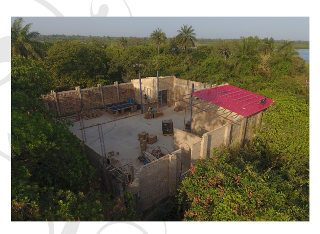
The new shop construction is marching along, with its first roof section and walls getting taller!

We made a significant step forward in the workshop construction this month! We have built the roof over one corner of the shop, covering my new office and the storage room where the solar electrical system will be installed. The patch of roof is small (only about 22'x22'), but important for several reasons. First, it's the beginning of the shop roof, which is exciting, even though it will be a while before we're ready to cover the whole rest of it. Second, by protecting the room where the solar electronics will live, we're able to begin the permanent installation of those components (rather than